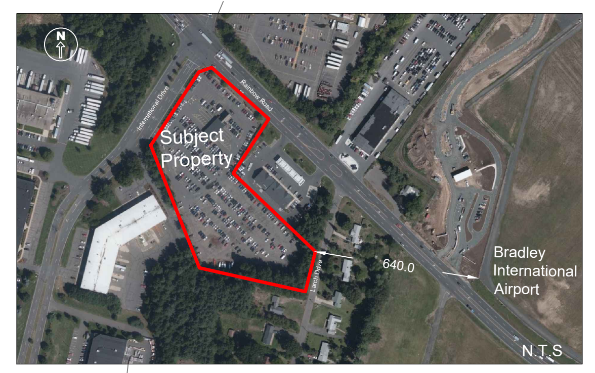
Distance of Subject Property to the Airport