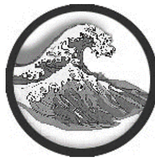
East Granby Middle School