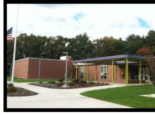
R. D. Seymour School