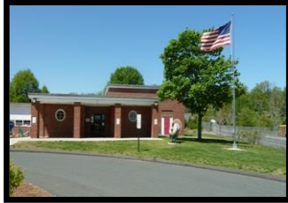
Carl D. Allgrove School