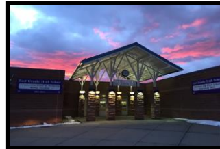
East Granby High School