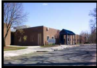
East Granby Middle School